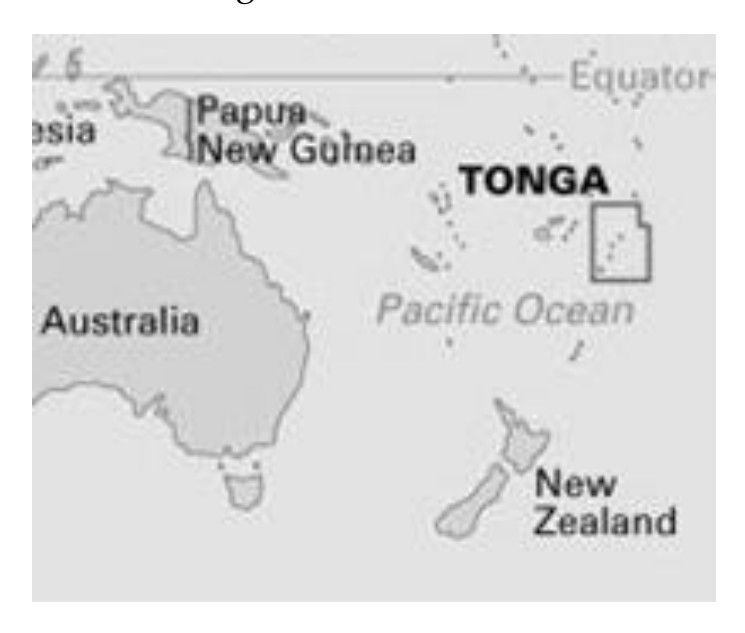
Figure 1: Location of Tonga

The Kingdom of Tonga consists of 175 islands and is situated approximately 2,000km north east of Auckland, New Zealand (see Figure 1).